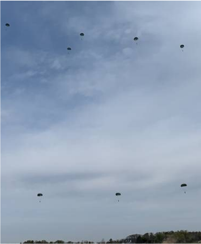
Image: Paratroopers in honor of Pee Wee Martin.

On a related note, for fellow aviation enthusiasts, I discovered a website called flightradar24.com last year. If you are like me and always curious about what is flying over you, this website is for you!